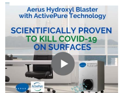
Aerus Hydroxyl Blaster with ActivePure Technology video: https://vimeo.com/463491042